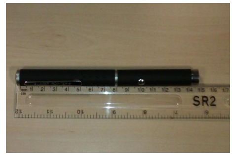
The laser pointer is matt black with a silver control button, clip, top and edge of laser aperture. It is approximately 15 cm long and 1 cm diameter.