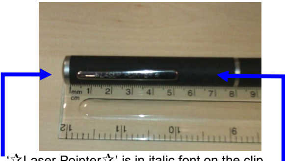
'☆Laser Pointer☆' is in italic font on the clip. There are some 2mm circular indentations here.