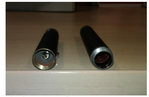
View inside the device. The laser pointer is powered by 2 AAA batteries.