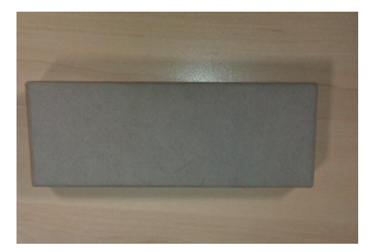
The unsafe laser pointer comes in a grey textured box