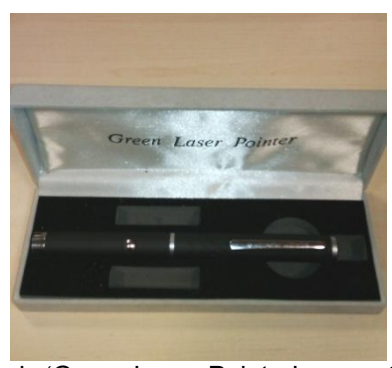
The words 'Green Laser Pointer' are on the inside.