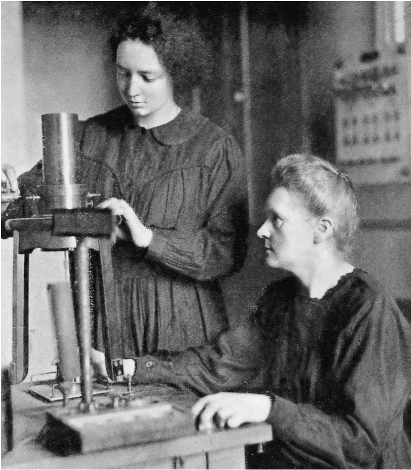
Information on the accompanying image: "Portrait of Marie Curie and her daughter Irene," (1925).