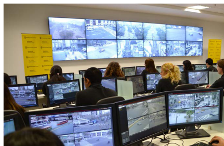
Metropolitan Police Monitoring Centre (CMU)