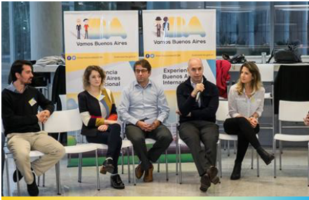
Welcome meeting with the Chief of Government