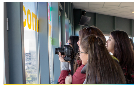
Buenos Aires City Park