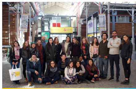
Metropolitan Design Center (CMD)