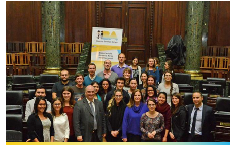
Buenos Aires City Legislature