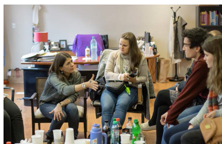
Meeting with Ministers