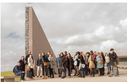
Parque de la Memoria