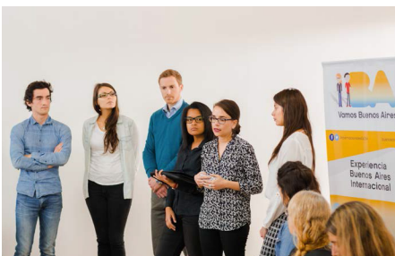
International Policy Cabinet