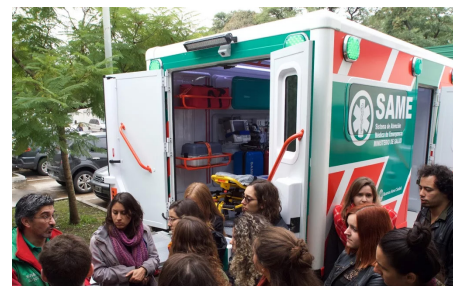
System of Medical Attention in Emergencies (SAME)