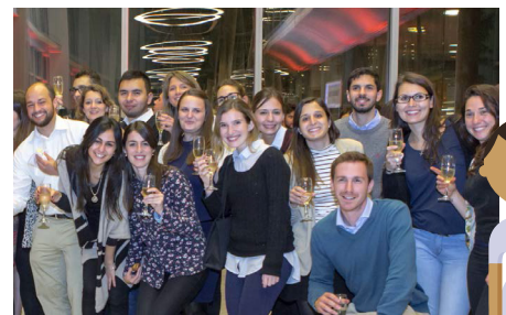
Closing ceremony and awarding of Certificates of participation