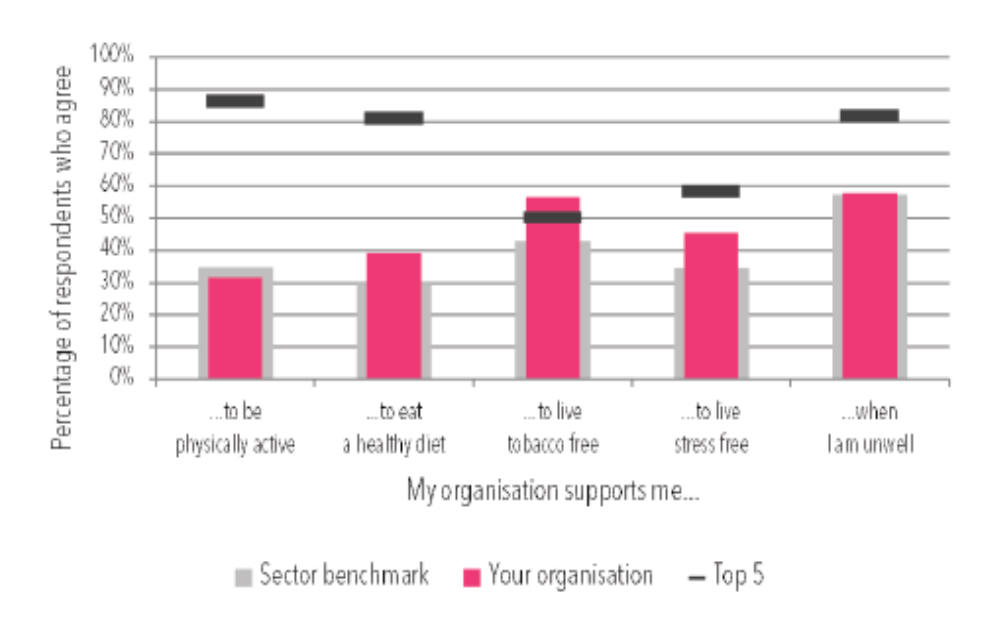
Figure 1: EMPLOYEE PERCEPTION OF ORGANISATIONAL SUPPORT