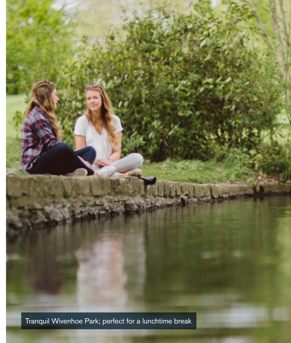
Tranquil Wivenhoe Park; perfect for a lunchtime break

Wivenhoe Park's tranquil landscape of more than 200 acres provides a tranquil place for all to enjoy, captured on canvas in 1816 by renowned painter John Constable.