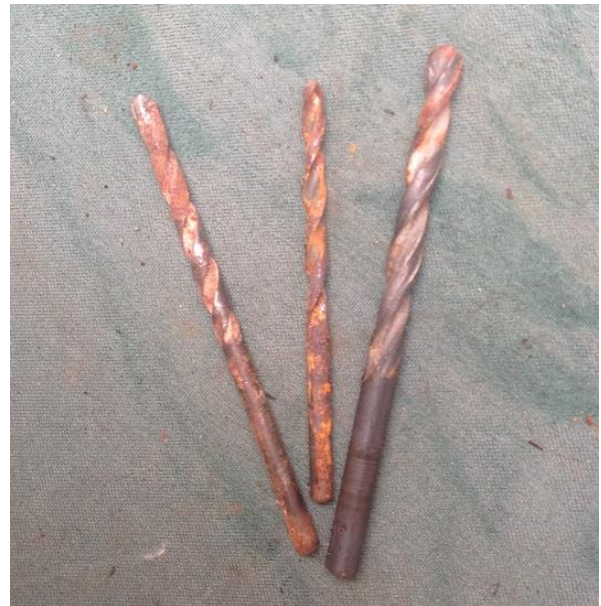
Rusted drill bits